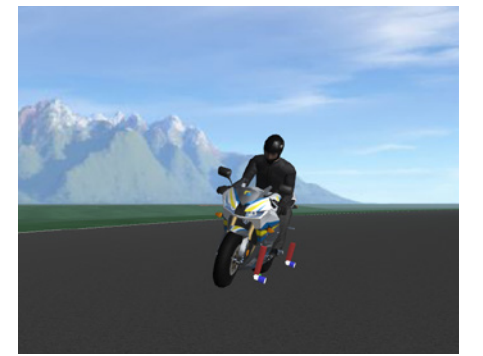
Visualization of the test in IPGMovie

With this hardware-in-the-loop test bench, Continental Engineering Services GmbH extends the test landscape to enable the development of vehicle dynamics control functions as well as advanced driver assistance system in the two-wheeler sector.